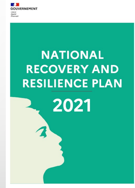
Extended Summary in english